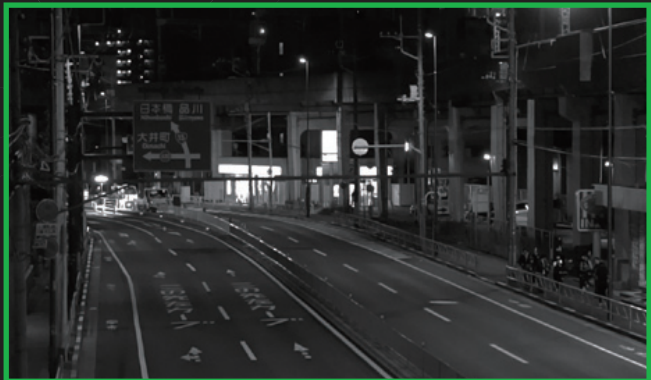
Cam_4 : Asako Fujikura Equipment : SONY α6500 Role : Follow group - high angle - full Position : high / far / front Source : hik_10.mp4