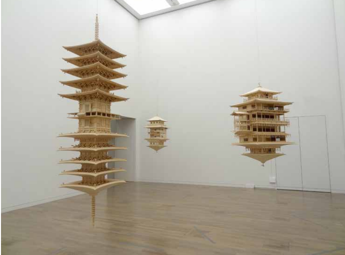
《平和記念日・広島》（「横雲」シリーズより）2011年 Hiroshima Peace Day (from the Cumulus series) 2011